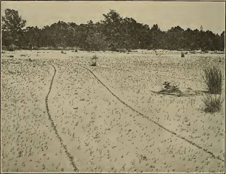
FIG. 5. Vegetation of sand plains in late summer, North Haven. The plant so common on the sand here is the annual, Trichostema dichotoma . Note the greater abundance of this plant in the wagon ruts—perhaps due to more favorable moisture relations there. In the right foreground are Andropogon scoparius and Asclepias syriaca .

plants inhabiting them, but except in a general way the subject of plant societies was not considered. These sand plains are a conspicuous feature of the central lowland of Connecticut. From a physiographic standpoint they represent outwash plains, developed during the final retreat of the continental glaciers, and now considerably dissected by stream erosion. One series of these plains stretches northward from New Haven, along the